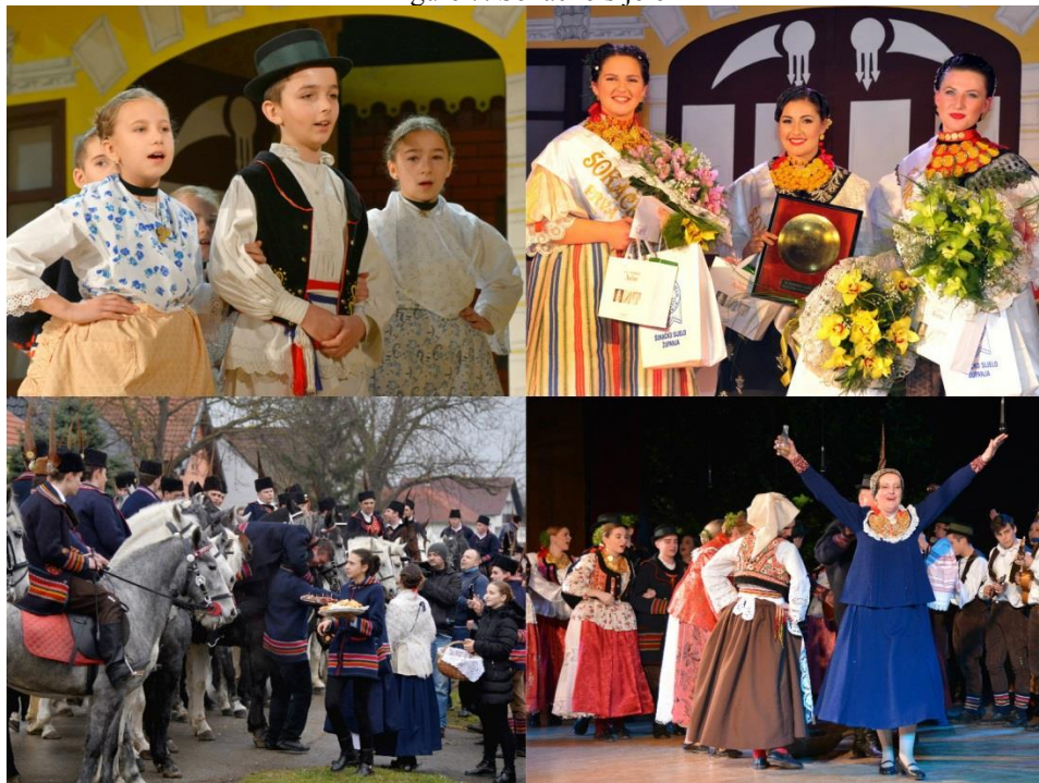
Figure 7. Šokačko sijelo

http://www.tz-zupanja.hr/dogadanja/sokacko-sijelo/