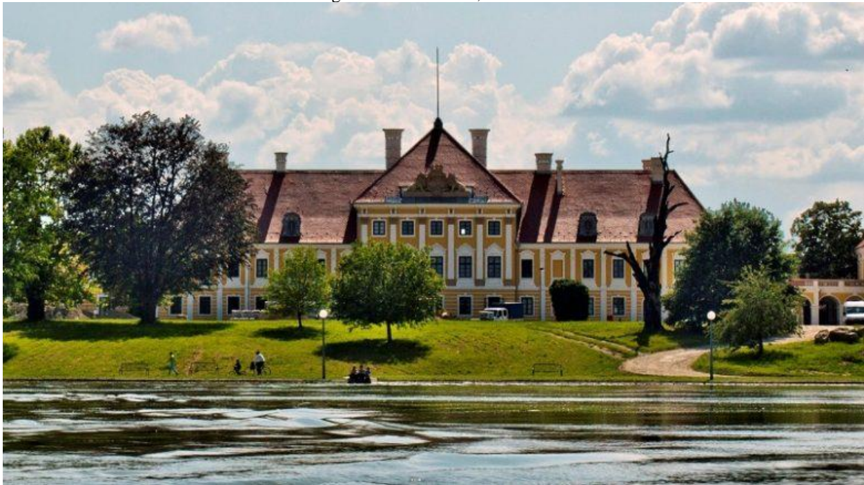
Figure 19. Castle Eltz, Vukovar

http://hotspots.net.hr/2016/12/setnjom-kroz-vukovar-upoznajmo-glasoviti-dvorac-eltz/