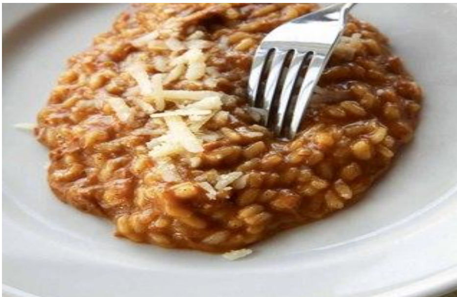
Picture 3.1.5.1. Skradinski rižot

Source: http://www.iceipice.hr/en/article/a-risotto-for-patient-carnivores , 30.08.2018.