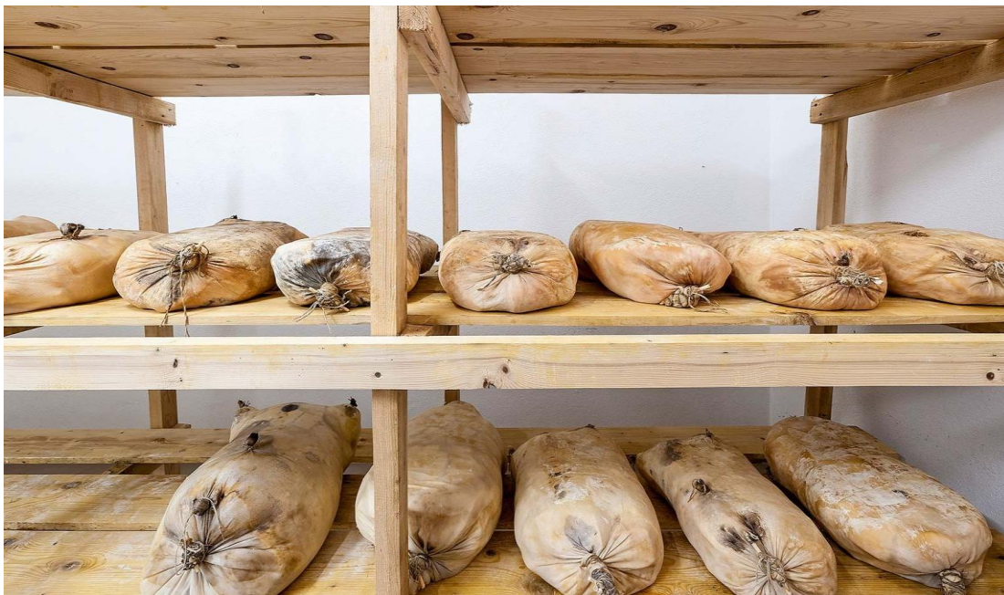
Picture 3.1.1.3. Cheese from mišina

Source: https://croatia.hr/en-GB/experiences/gastronomy-and-enology/dalmatia-sibenik/sir-iz-misine , 17.08.2018.