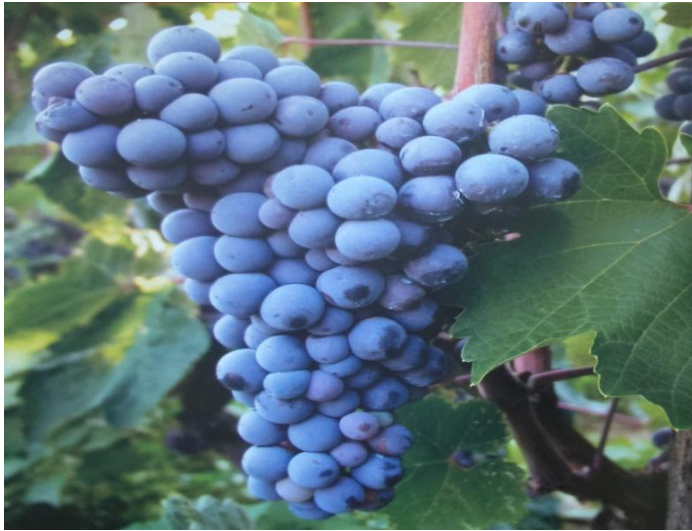
Picture 3.3.1.2. Plavina variety

Source: https://agroblohortikultura.wordpress.com/2016/06/20/plavina-plavka-marasovka-blatina/ , 21.08.2018.