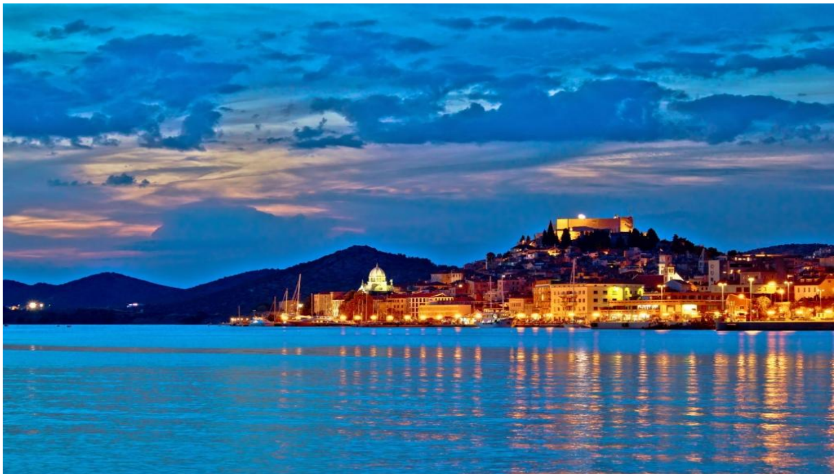
Picture 2.4.1. Šibenik

Source: https://www.bestofcroatia.eu/hr/podregije-detalji/riviera-sibenik-27 , 25.08.2018.