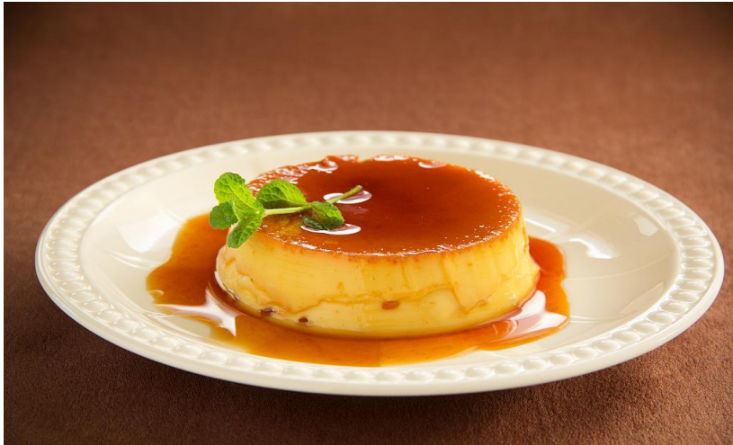
Picture 3.4.2.1. Rožata

Source: https://www.noninazdravakuhinja.com/recept/rozata/ , 23.08.2018.