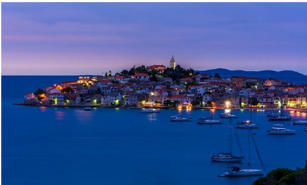
Picture 4.1.3. Primošten

Source: http://www.tz-primosten.hr/ , 31.08.2018.