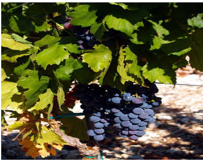
Picture 3.3.1.1. Babić variety

Source: http://www.miva.com.hr/hr/proizvodaci/gracin/379/ , 21.08.2018.