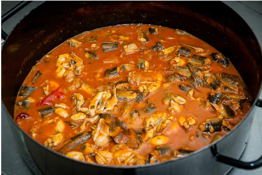
Picture 3.2.2.1. Brudet

Source: https://www.sailingeurope.com/blog/brodet-probably-the-most-typical-dalmatian-meal , 19.08.2018.