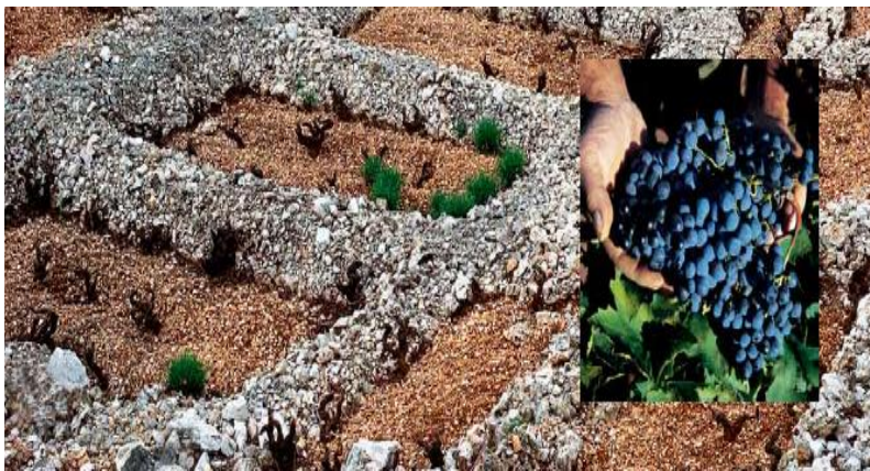
Picture 3.3.1. Primošten karst vineyard