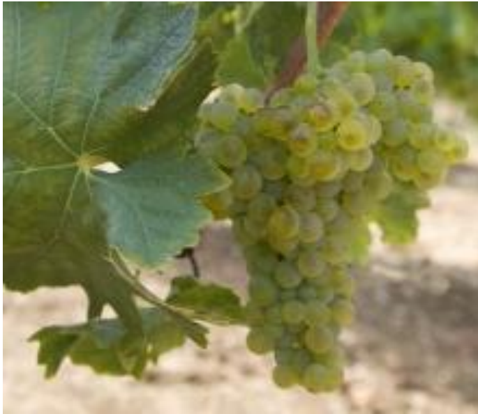
Picture 3.3.2.1. Maraština variety

Source: http://www.vinarija-posip-cara.hr/vineyards/variety-of-rukatac/?lang=en , 22.08.2018.