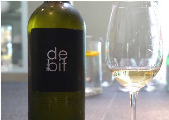
Picture 3.3.2.2. Debit wine from Bibich winery

Source: https://www.bluedanubewine.com/blog/2016/08/winewednesday-spotlight-51-bibich-debit/ , 22.08.2018.