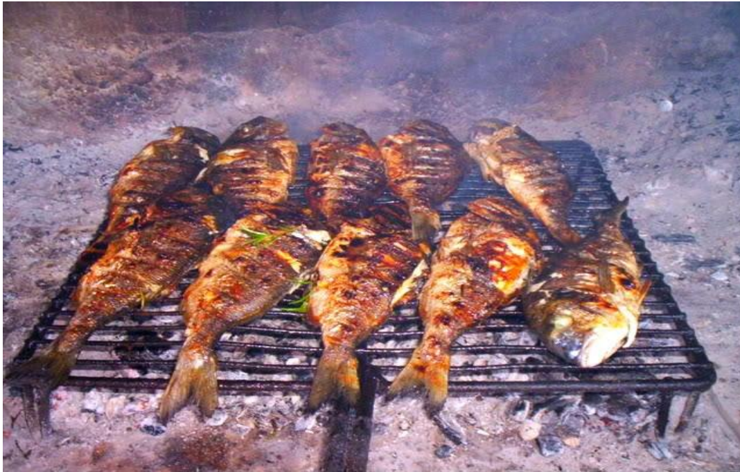
Picture 3.2.1.1. Brancin on gradele

Source: https://steemit.com/cooking/@bilogorac/fish-brancin , 19.08.2018.