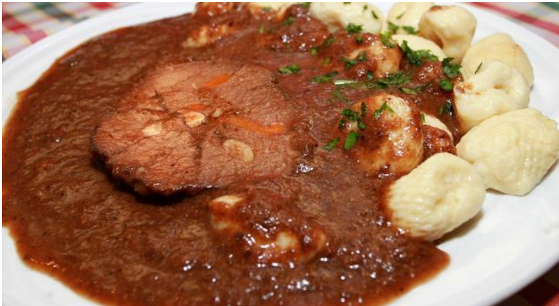
Picture 3.1.3.1. Pašticada with gnocchi

Source: https://www.24sata.hr/lifestyle/slasna-pasticada-po-receptu-i-savjetima-splitskog-majstora-382278 , 18.08.2018.