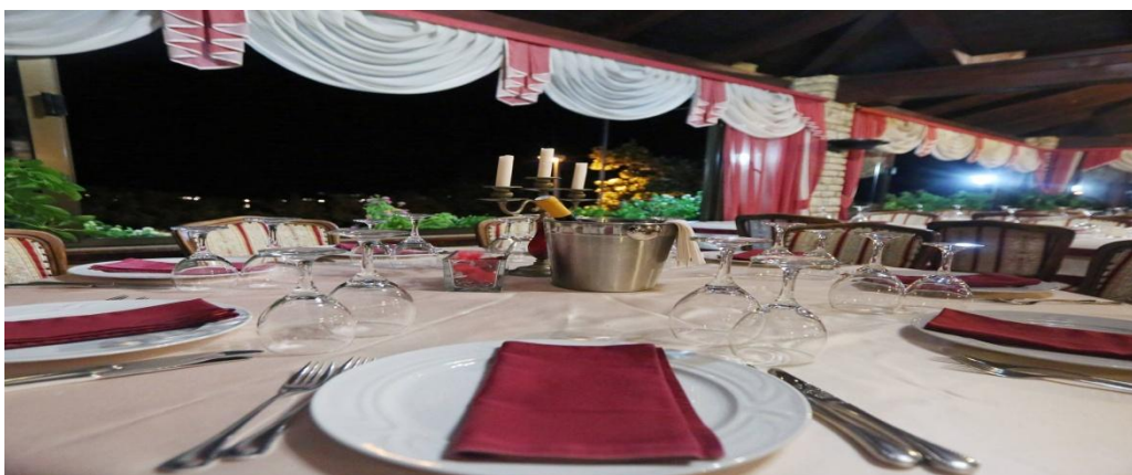
Picture 4.1.2. Barun restaurant

Source: https://www.crogourmet365.hr/ugostitelji/restorani/restoran-barun-200 , 31.08.2018.