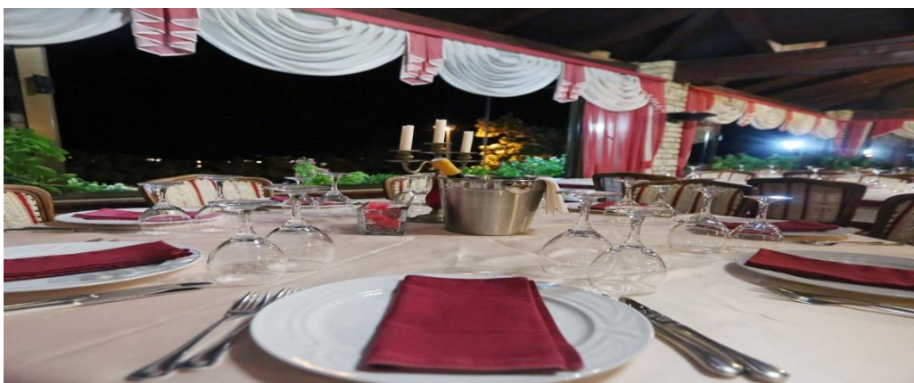
Picture 4.1.2. Barun restaurant

Source: https://www.crogourmet365.hr/ugostitelji/restorani/restoran-barun-200 , 31.08.2018.