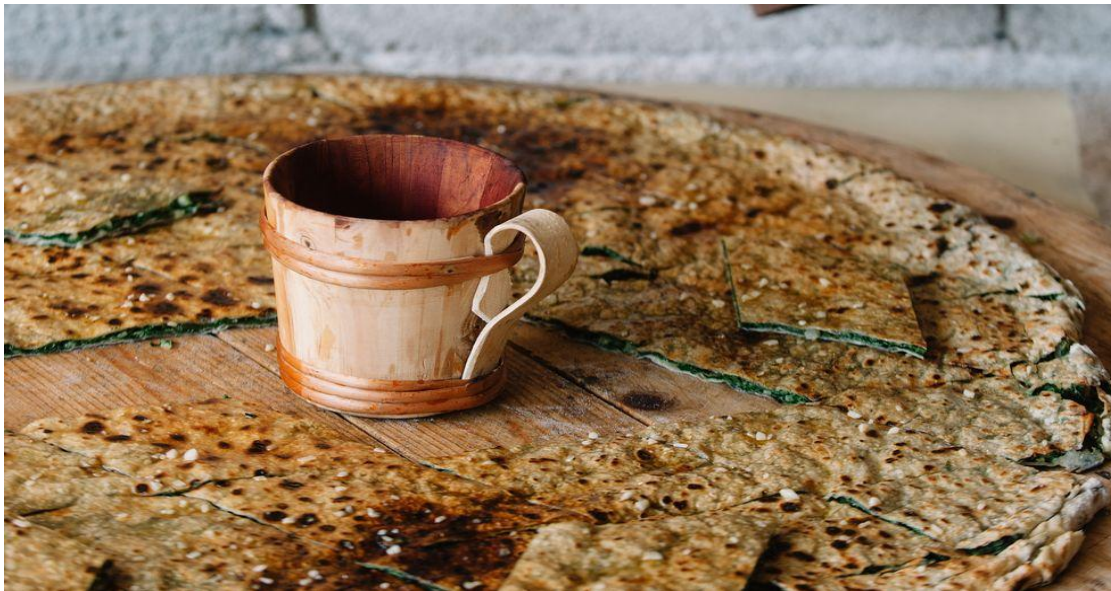
Picture 3.1.4.1. Soparnik with the bukara in the middle

Source: https://www.jutarnji.hr/dobrahrana/price/portal-great-british-chefs-ako-volite-putovati-i-jesti-hrvatska-je-zemlja-za-vas/6654192/ , 18.08.2018.