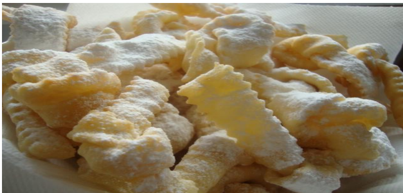
Picture 3.4.3.2. Kroštule

Source: https://www.coolinarika.com/recept/906871/ , 30.08.2018.