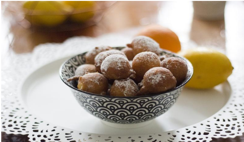
Picture 3.4.3.1. Fritule