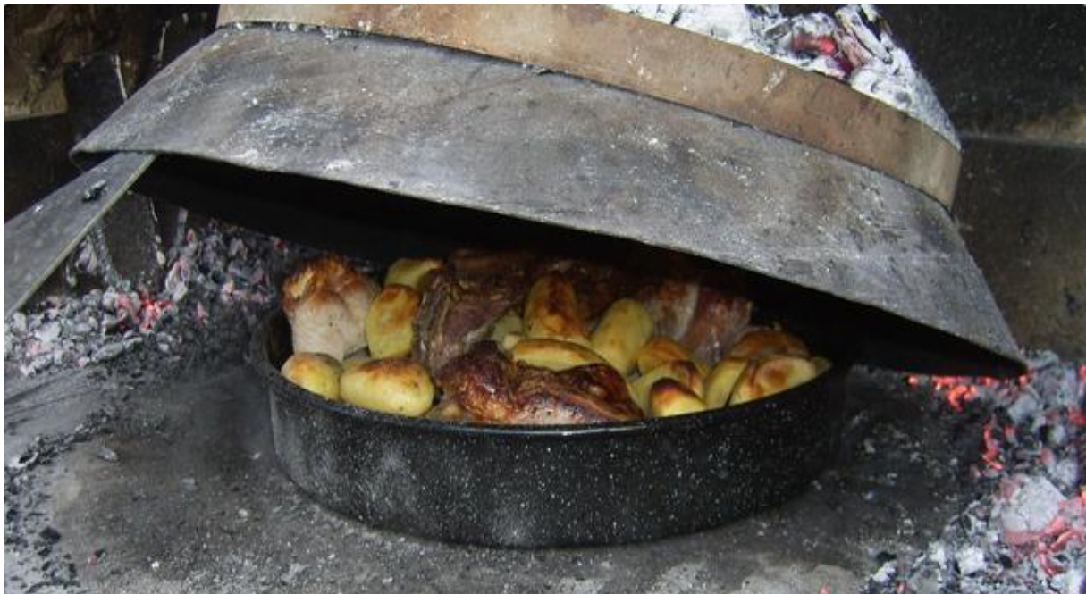
Picture 3.1.2.1. Lamb under peka

Source: https://www.coolinarika.com/recept/jaretina-pod-pekomp/ , 17.08.2018.