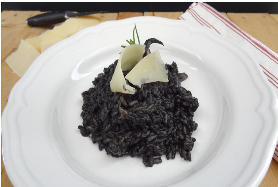
Picture 3.2.4.1. Black risotto

Source: http://www.kuhaona.com/en/2016/08/black-cuttlefish-risotto/ , 20.08.2018.