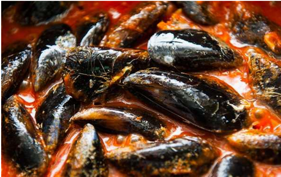
Picture 3.2.3.1. Mussels made on buzara

Source: http://www.cromaris.hr/dagnje-na-crvenu-buzaru-r50 , 20.08.2018.