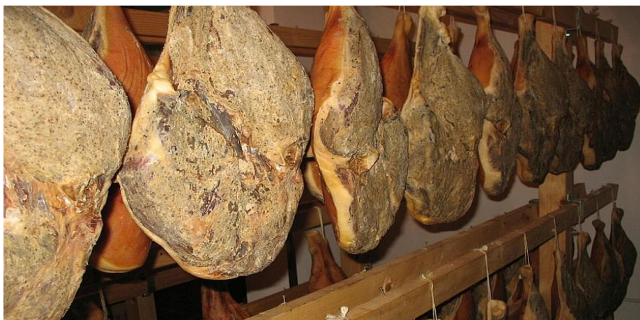
Picture 3.1.1.1. Drniš prosciutto

Source: https://www.drniskiprsut.com/drniski-prsut/karakteristike-prsuta , 16.08.2018.