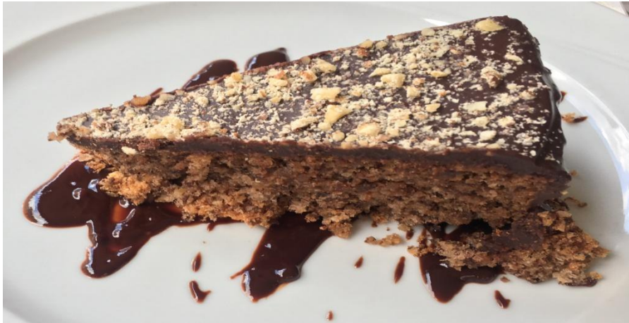
Picture 3.4.1.1. Piece of Skradin cake

Source: http://unraveltravel.org/category/croatia/ , 23.08.2018.