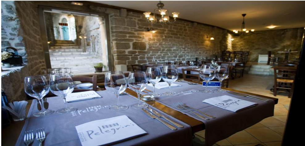
Picture 4.1.1. Pelegrini restaurant

Source: http://www.dobri-restorani.hr/restoran/pelegrini/ , 31.08.2018.