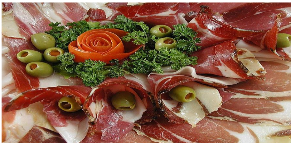
Picture 3.1.1.2. Drniš prosciutto on the plate

Source: https://www.drniskiprsut.com/drniski-prsut/karakteristike-prsuta , 16.08.2018.