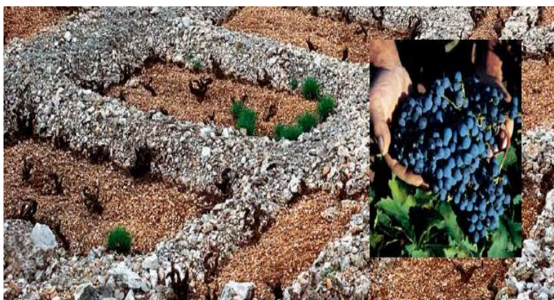
Picture 3.3.1. Primošten karst vineyard