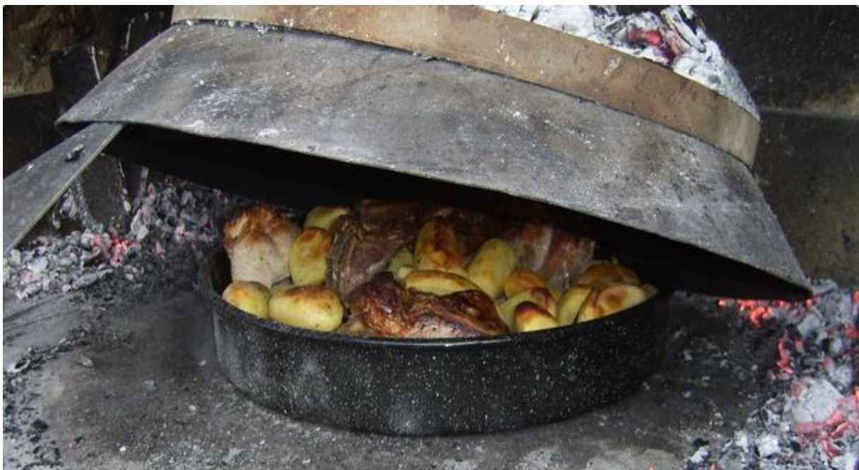
Picture 3.1.2.1. Lamb under peka

Source: https://www.coolinarika.com/recept/jaretina-pod-pekomp/ , 17.08.2018.