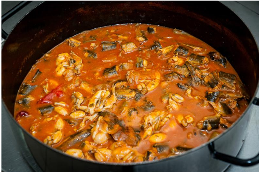
Picture 3.2.2.1. Brudet

Source: https://www.sailingeurope.com/blog/brodet-probably-the-most-typical-dalmatian-meal , 19.08.2018.