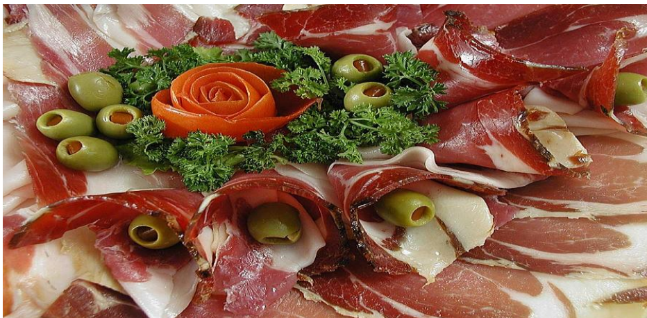
Picture 3.1.1.2. Drniš prosciutto on the plate

Source: https://www.drniskiprsut.com/drniski-prsut/karakteristike-prsuta , 16.08.2018.