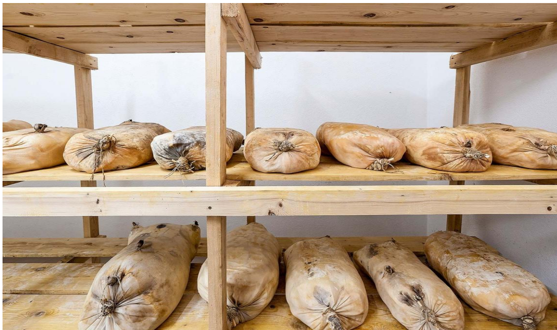
Picture 3.1.1.3. Cheese from mišina

Source: https://croatia.hr/en-GB/experiences/gastronomy-and-enology/dalmatia-sibenik/sir-iz-misine , 17.08.2018.