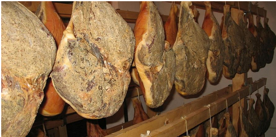
Picture 3.1.1.1. Drniš prosciutto

Source: https://www.drniskiprsut.com/drniski-prsut/karakteristike-prsuta , 16.08.2018.