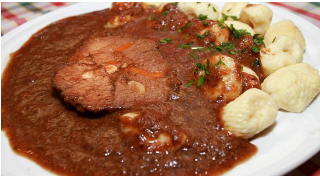
Picture 3.1.3.1. Paštica with gnocchi

Source: https://www.24sata.hr/lifestyle/slasna-pasticada-po-receptu-i-savjetima-splitskog-majstora-382278 , 18.08.2018.