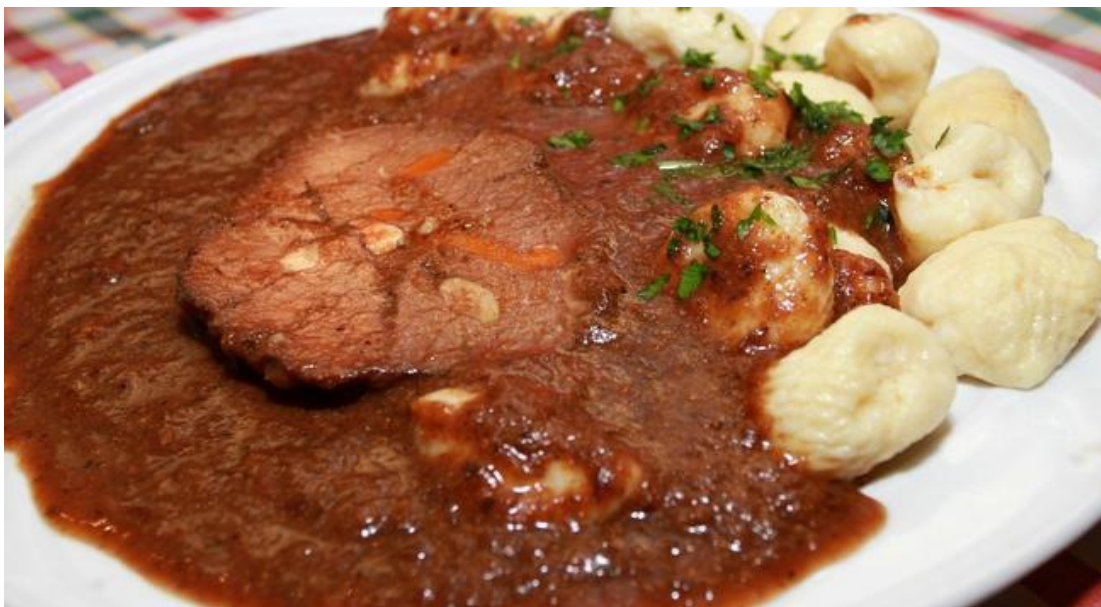
Picture 3.1.3.1. Pašticada with gnocchi

Source: https://www.24sata.hr/lifestyle/slasna-pasticada-po-receptu-i-savjetima-splitskog-majstora-382278 , 18.08.2018.