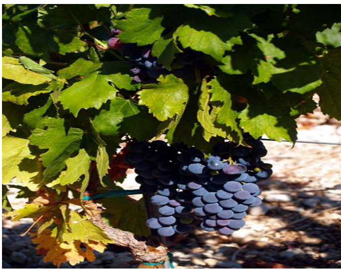
Picture 3.3.1.1. Babić variety

Source: http://www.miva.com.hr/hr/proizvodaci/gracin/379/ , 21.08.2018.