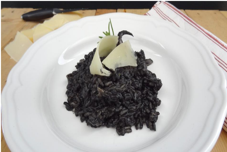
Picture 3.2.4.1. Black risotto

Source: http://www.kuhaona.com/en/2016/08/black-cuttlefish-risotto/ , 20.08.2018.