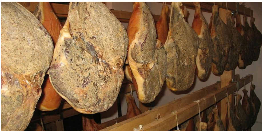
Picture 3.1.1.1. Drniš prosciutto

Source: https://www.drniskiprsut.com/drniski-prsut/karakteristike-prsuta , 16.08.2018.