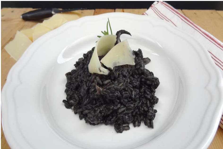
Picture 3.2.4.1. Black risotto

Source: http://www.kuhaona.com/en/2016/08/black-cuttlefish-risotto/ , 20.08.2018.