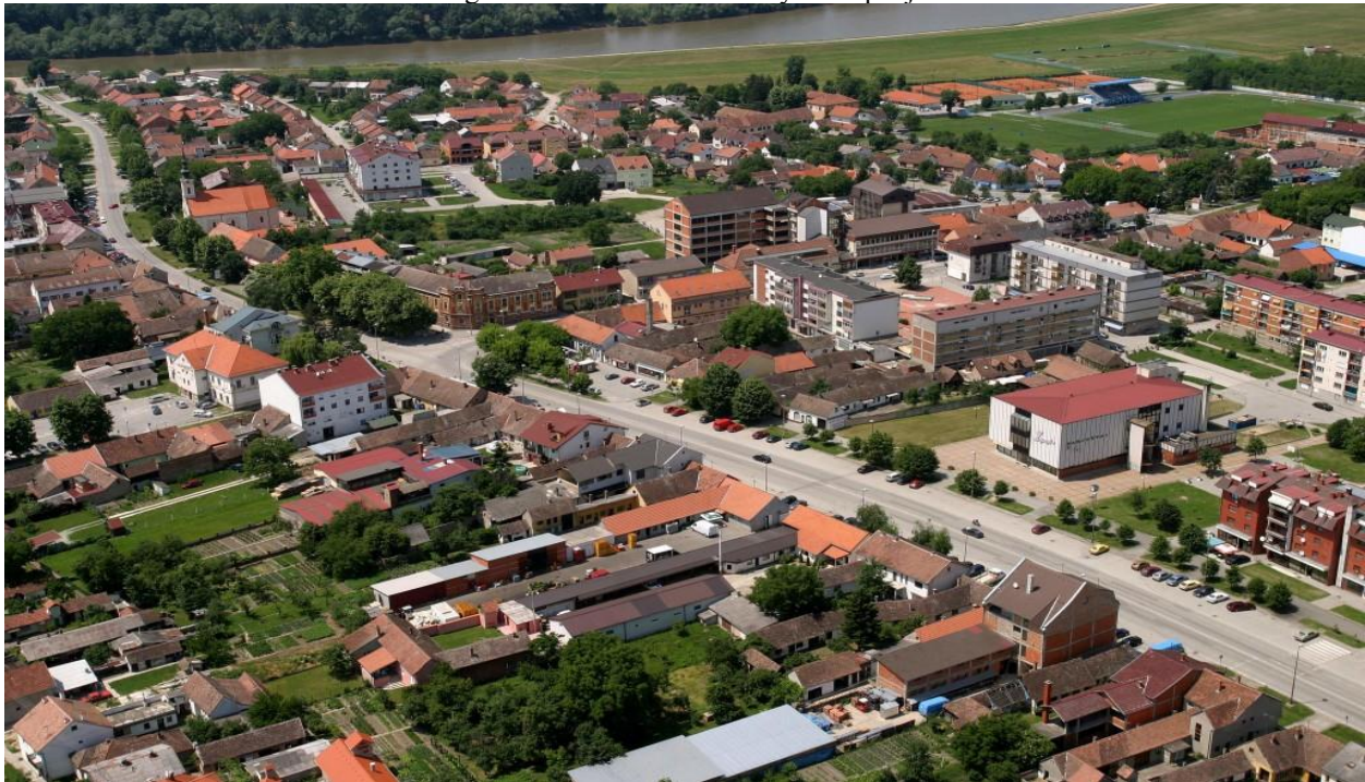
Figure 2. Panorama of the city of Županja