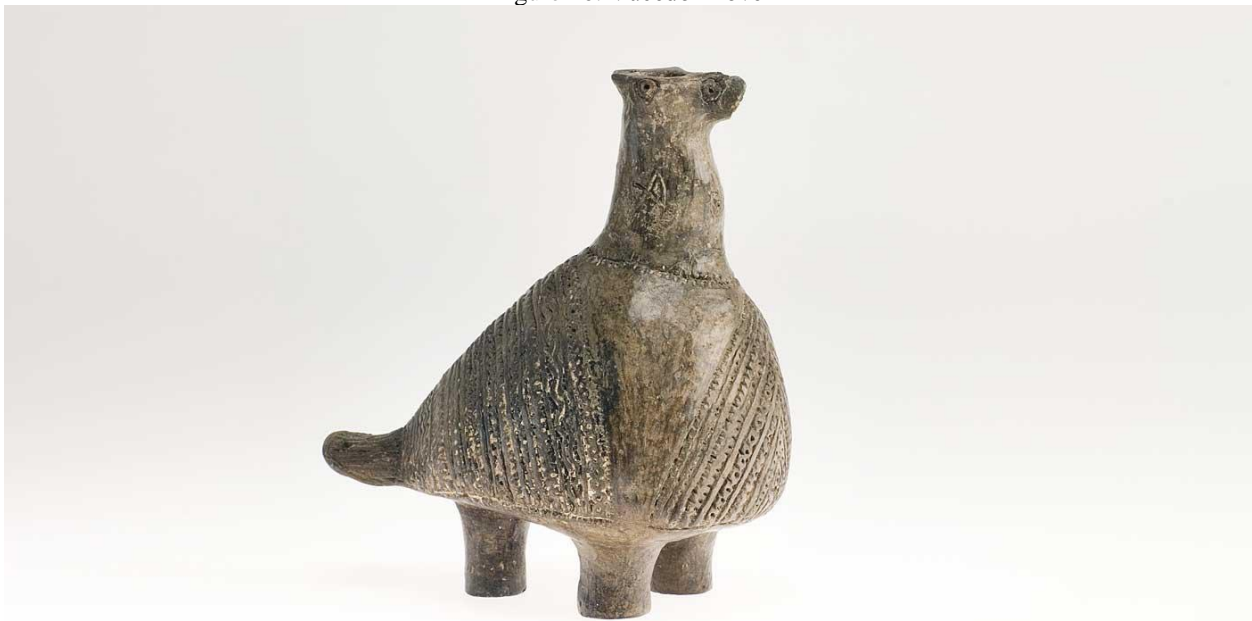
Figure 20. Vučedol Dove

https://www.starapovijest.eu/posuda-u-obliku-ptice-iz-vucedola/