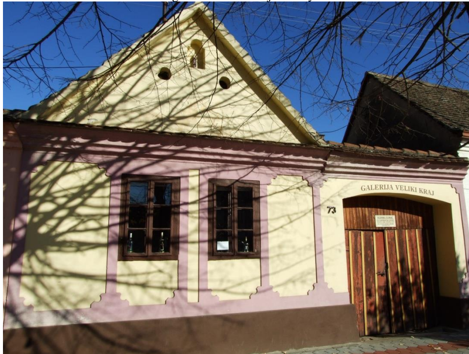
Figure 5. Veliki Kraj Gallery

http://www.tz-zupanja.hr/galerija-veliki-kraj/