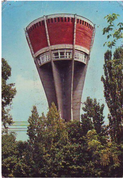
Figure 17. Water Tower before the Homeland war

http://www.igre123.net/tomislav00/slike/vodotoranj-prije-rata/1131