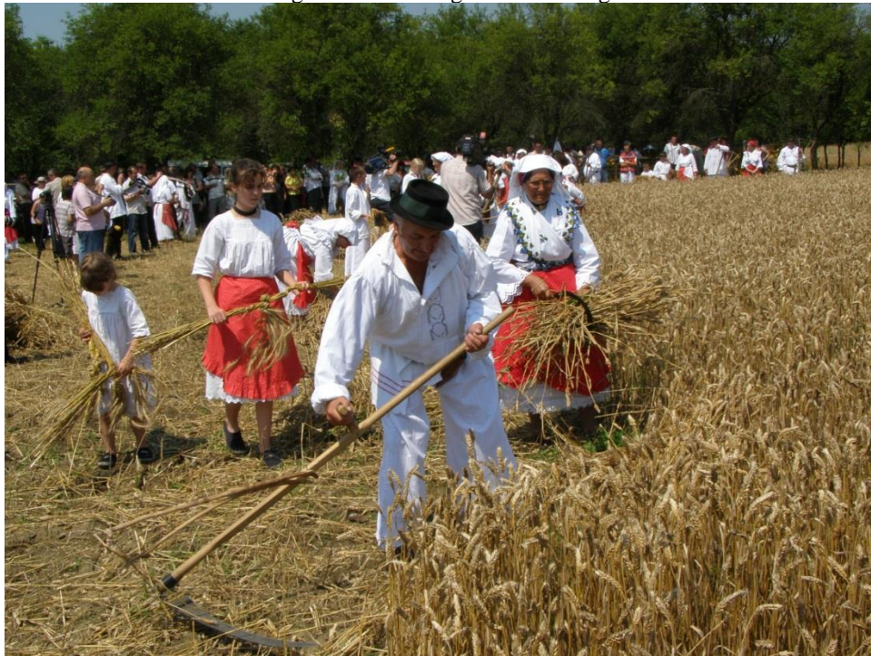
Figure 8. Threshing and harvesting

http://www.tz-zupanja.hr/dogadanja/zetva-i-vrsidba-u-proslosti/