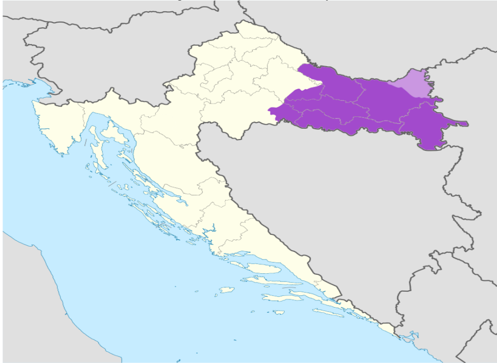
Figure 1. Slavonia and Baranya

including Battle of Vukovar. The war effectively ended in 1995 with Croatia achieving a decisive victory over the Republic of Serbian Krajina in August 1995. The remaining occupied areas – Eastern Slavonia – were restored to Croatia pursuant to the Erdut Agreement of November 1995, with the process concluded in January 1998.