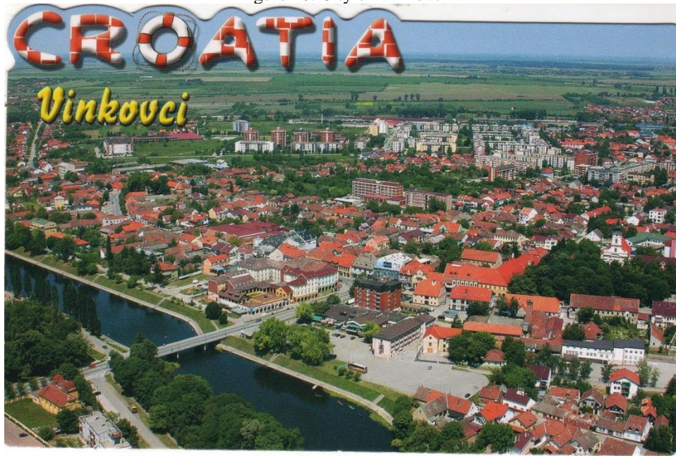
Figure 10. City of Vinkovci

http://www.skyscrapercity.com/showthread.php?t=259127&page=7