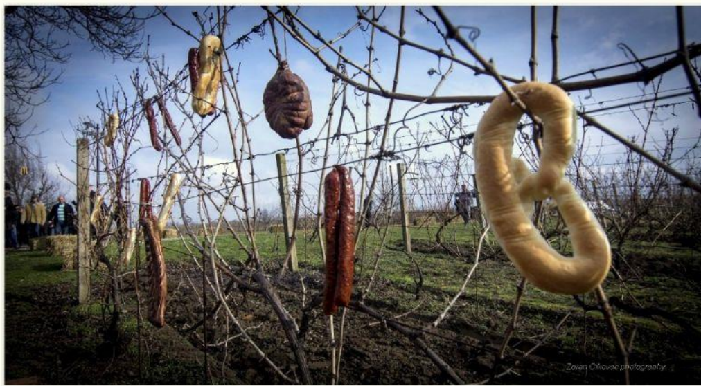
Figure 21. Saint Vinko's Day

http://www.turizamvukovar.hr/vukovar_eng.php?stranica=180