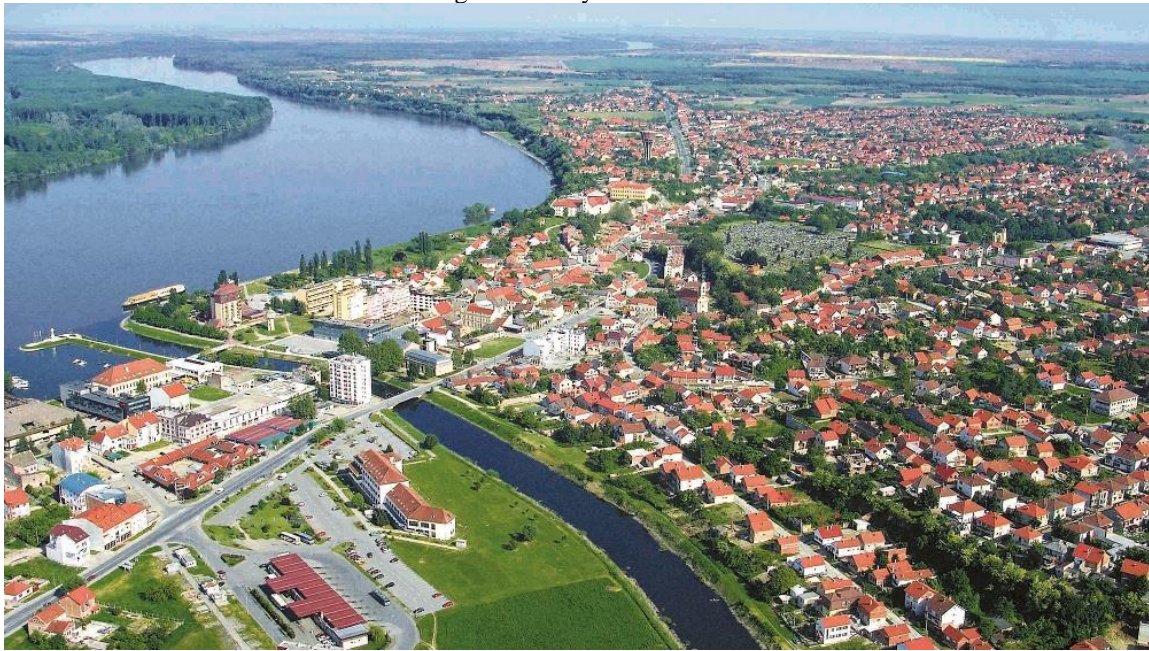
Figure 16. City of Vukovar

http://www.geografija.hr/hrvatska/razvoj-turizma-u-gradu-vukovaru-primjena-swot-analize/