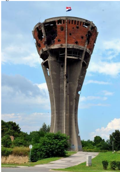
Figure 18. Water Tower after the Homeland war

http://os-brestje-zg.skole.hr/?news_id=417