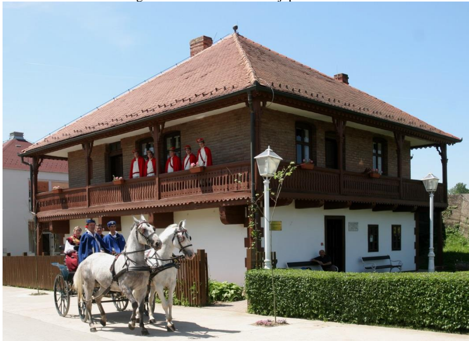
Figure 4. Native Museum Stjepan Gruber

http://www.tz-zupanja.hr/zavicajni-muzej/