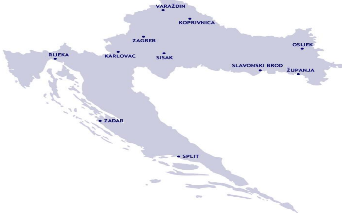
Figure 3. Geographic position of the city of Županja

http://www.zagrebsped.hr/podruznice.html