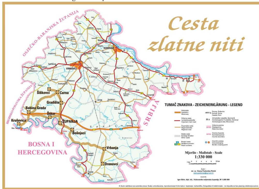
Figure 9. Map of the Road of the Golden thread

http://www.tz-zupanja.hr/turisticki-put-cesta-zlatne-niti/