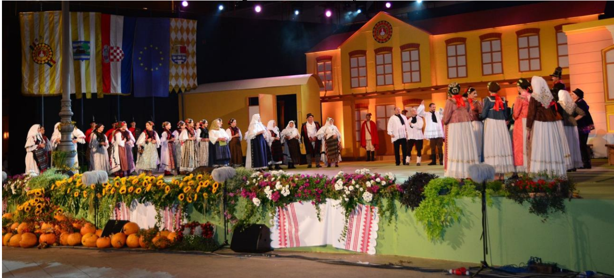
Figure 13. Vinkovačke jeseni

http://www.nacional.hr/vinkovacke-jeseni-pod-geslom-vecer-oprostajna/