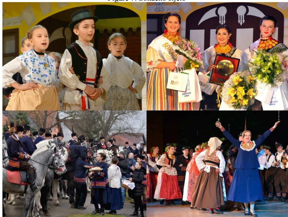
Figure 7. Šokačko sijelo

http://www.tz-zupanja.hr/dogadanja/sokacko-sijelo/