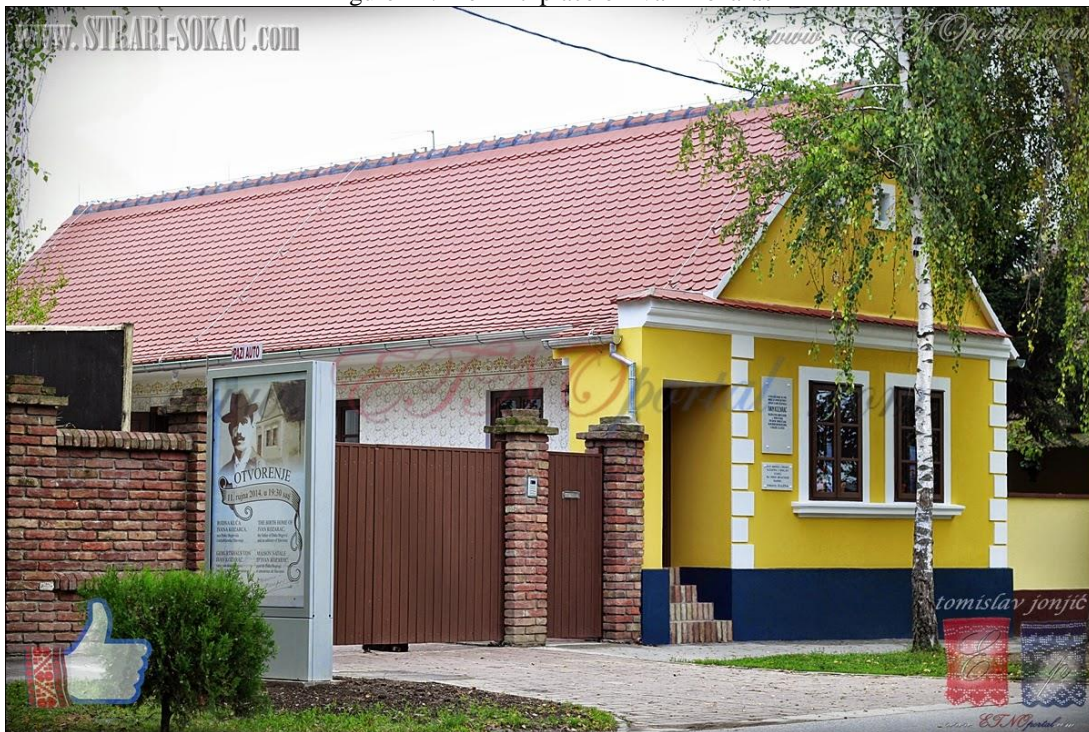
Figure 12. The Birthplace of Ivan Kozarac

http://www.etnoportal.com/galerija/ivan-kozarac-sa-krnjasa/