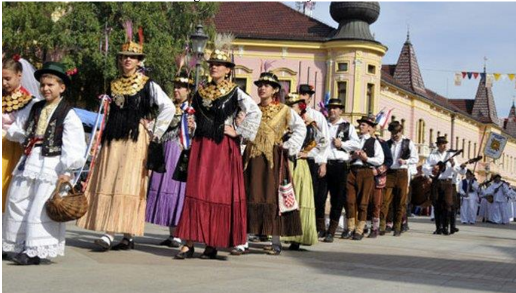
Figure 14. Vinkovačke jeseni

http://vijesti.hrt.hr/255588/pocinju-49-vinkovacke-jeseni