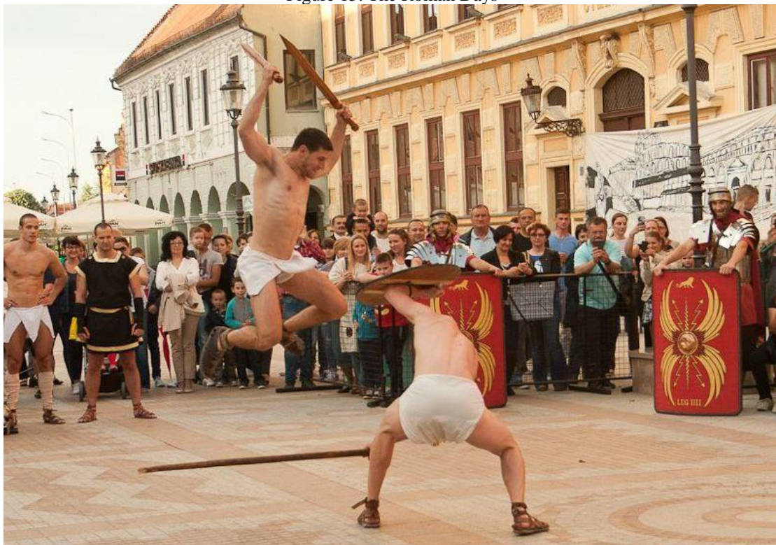
Figure 15. The Roman Days

http://hrturizam.hr/iv-rimski-dani-od-13-20-svibnja-u-vinkovcima/