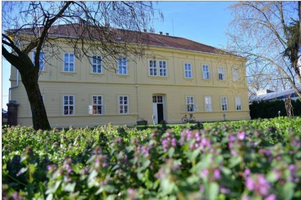
Figure 6. City Library

http://www.tz-zupanja.hr/gradska-knjiznica/