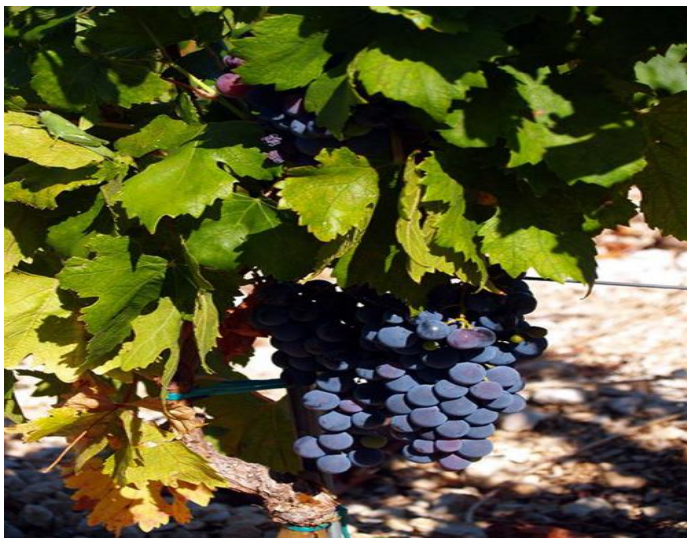
Picture 3.3.1.1. Babić variety

Source: http://www.miva.com.hr/hr/proizvodaci/gracin/379/ , 21.08.2018.