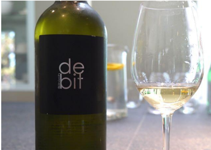
Picture 3.3.2.2. Debit wine from Bibich winery

Source: https://www.bluedanubewine.com/blog/2016/08/winewednesday-spotlight-51-bibich-debit/ , 22.08.2018.