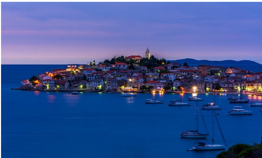
Picture 4.1.3. Primošten

Source: http://www.tz-primosten.hr/ , 31.08.2018.