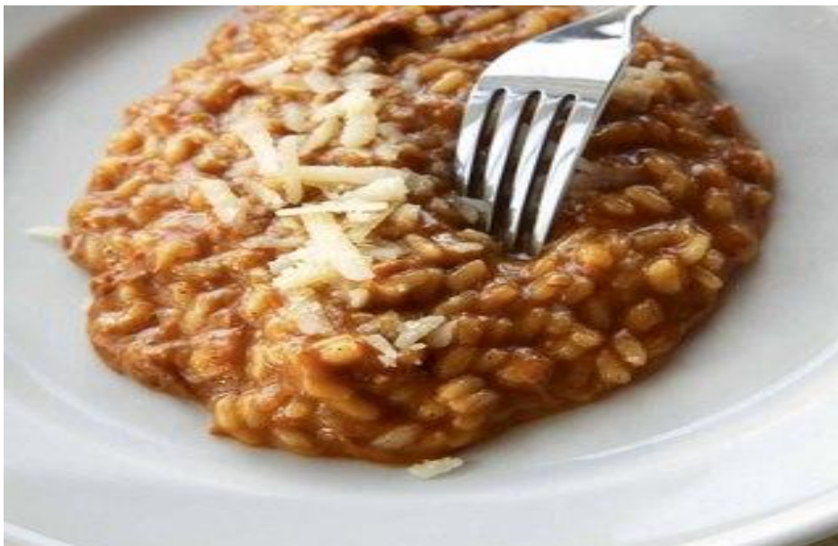
Picture 3.1.5.1. Skradinski rižot

Source: http://www.iceipice.hr/en/article/a-risotto-for-patient-carnivores , 30.08.2018.