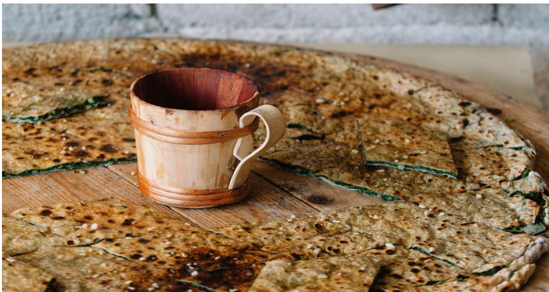
Picture 3.1.4.1. Soparnik with the bukara in the middle

Source: https://www.jutarnji.hr/dobrahrana/price/portal-great-british-chefs-ako-volite-putovati-i-jesti-hrvatska-je-zemlja-za-vas/6654192/ , 18.08.2018.