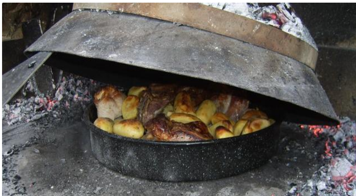
Picture 3.1.2.1. Lamb under peka

Source: https://www.coolinarika.com/recept/jaretina-pod-pekomp/ , 17.08.2018.