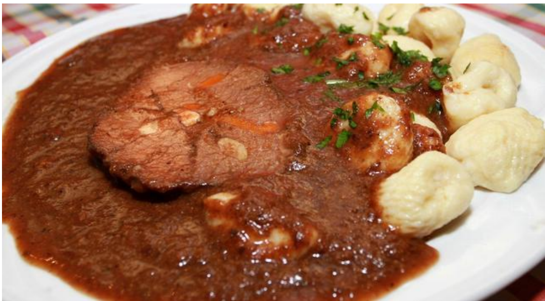
Picture 3.1.3.1. Pašticada with gnocchi

Source: https://www.24sata.hr/lifestyle/slasna-pasticada-po-receptu-i-savjetima-splitskog-majstora-382278 , 18.08.2018.