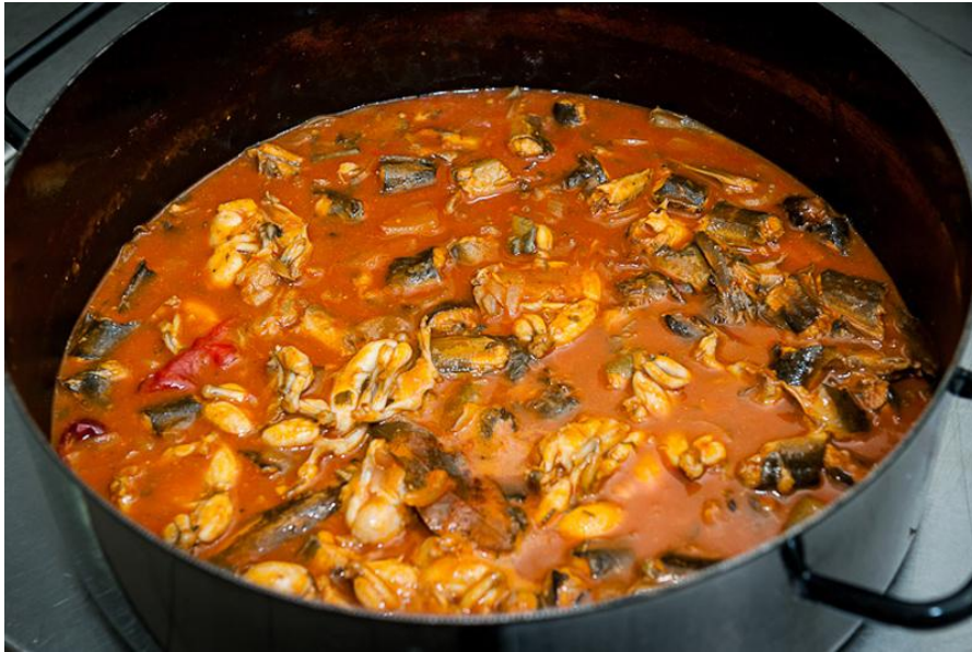
Picture 3.2.2.1. Brudet

Source: https://www.sailingeurope.com/blog/brodet-probably-the-most-typical-dalmatian-meal , 19.08.2018.