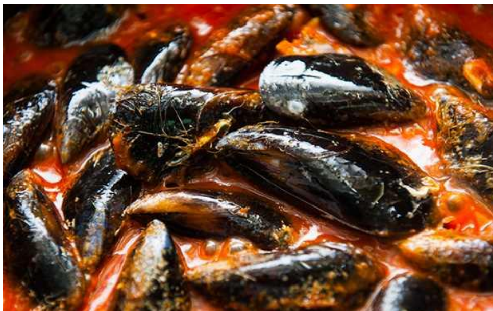
Picture 3.2.3.1. Mussels made on buzara

Source: http://www.cromaris.hr/dagnje-na-crvenu-buzaru-r50 , 20.08.2018.