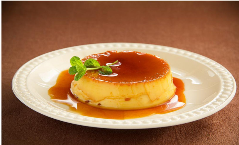
Picture 3.4.2.1. Rožata

Source: https://www.noninazdravakuhinja.com/recept/rozata/ , 23.08.2018.