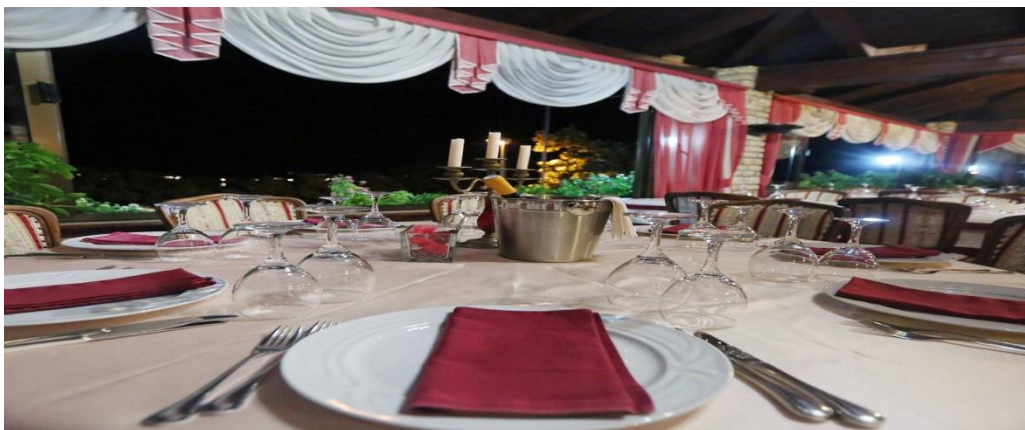
Picture 4.1.2. Barun restaurant

Source: https://www.crogourmet365.hr/ugostitelji/restorani/restoran-barun-200 , 31.08.2018.